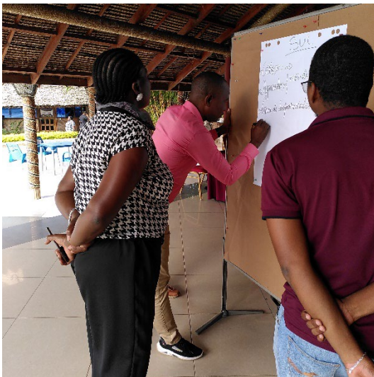
Conflict sensitivity workshop in Nampula, Mozambique

Conflict sensitivity is the awareness that our work, presence, and behavior can have unintended consequences. It means taking action to avoid negative effects and reinforce our positive impact. Conflict sensitivity is integrated into all Helvetas' programs, along with the related topics of gender sensitivity and social inclusion, and we support partners and clients to do the same.