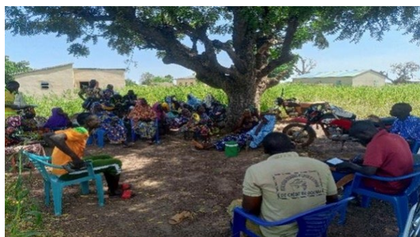
Nambouli village assembly to establish infrastructure management committee, October 2023

The “Wéi” project promotes the stabilization and prevention of violent conflicts in the Atacora region of northern Benin, which is heavily affected by conflicts between farmers and herders, insurgent attacks and tensions around access to natural resources in national parks. It promotes access to and management of green economic and social infrastructure, supports local mechanisms for preventing and resolving conflicts, improves the management of natural resources, and strengthens cross-border cooperation.