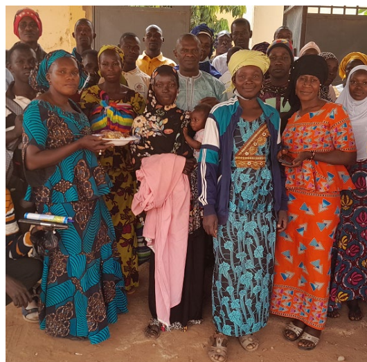
GYPI project staff with key partners in central Mali

Access to land is at the heart of many intergenerational conflicts in Mali. The project "Peacebuilding through access to agricultural land for young women and men in the Sahelian zone of Mali" supported young people to peacefully secure access to land by helping claim their legal rights and strengthen their farming capacity, and by supporting dispute resolution mechanisms.