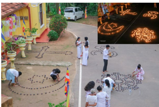
Youth respecting religious diversity by celebrating 'Vesak'

The project promoted reconciliation and social cohesion by involving youth in inter-ethnic, inter-religious, inter-generational and inter-cultural development. Young Sri Lankan women and men from different backgrounds received training and were supported to build relationships across ethnic and religious boundaries and to promote positive social change in their communities. Youth-led cooperatives and social enterprises were initiated to build capacities in mitigating the socio-economic drivers of violent extremism.