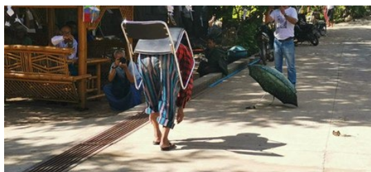
An artist's performance

The project supported civil society organizations (CSO), interfaith groups and artists to play a prominent role in fostering intercultural dialogue, non-discrimination, and respect for diversity. By providing support through 1) capacity development, 2) financial support and coaching, 3) public relations activities and 4) advocacy for a pluralistic society, the project facilitated safe and creative spaces for inclusive exchange and peaceful dialogue among and between different groups.