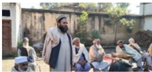
Trained mediators holding a Jirga for resolution of a land dispute in Khyber District

The project contributed to building peace between communities in the former Federally Administered Tribal Areas (FATA). In an area where natural resources (pastures, forests, water) are generally held in communal ownership, the project supported community mediators to resolve disputes and engaged local authorities and civil society organizations in confidence-building measures and dialogue around land and water management.