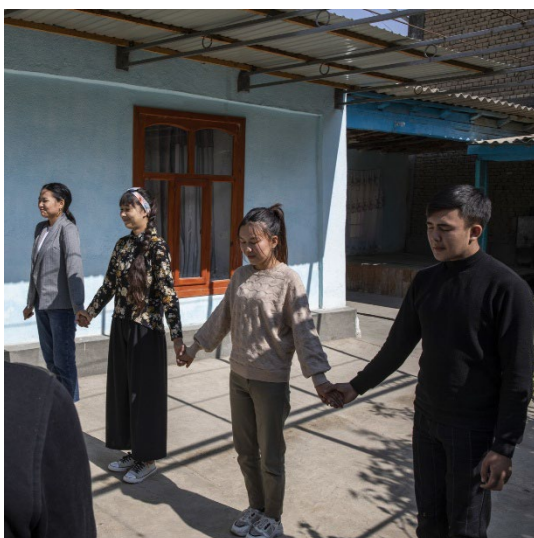
A personal development training for youth in south Kyrgyzstan

The Youth United for the Future project (YOU) helps young people to identify their personal and professional purpose in life and promotes constructive dialogue between young people and adults. By supporting the meaningful participation of young people in family, social and public life, the project contributes to a more cohesive society and reduces the vulnerability of young people to engaging in activities leading to violence.